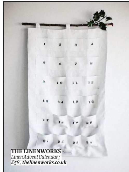
THE LINENWORKS Linen Advent Calendar; £58, thelinenworks.co.uk