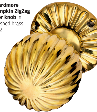
Beardmore Pumpkin ZigZag door knob in polished brass, £222