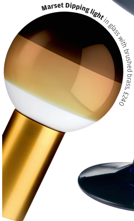
Marset Dipping light in glass with brushed brass, £240