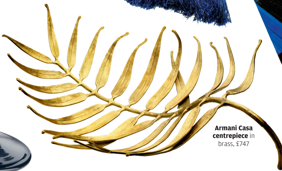
Armani Casa centerpiece in brass, £747