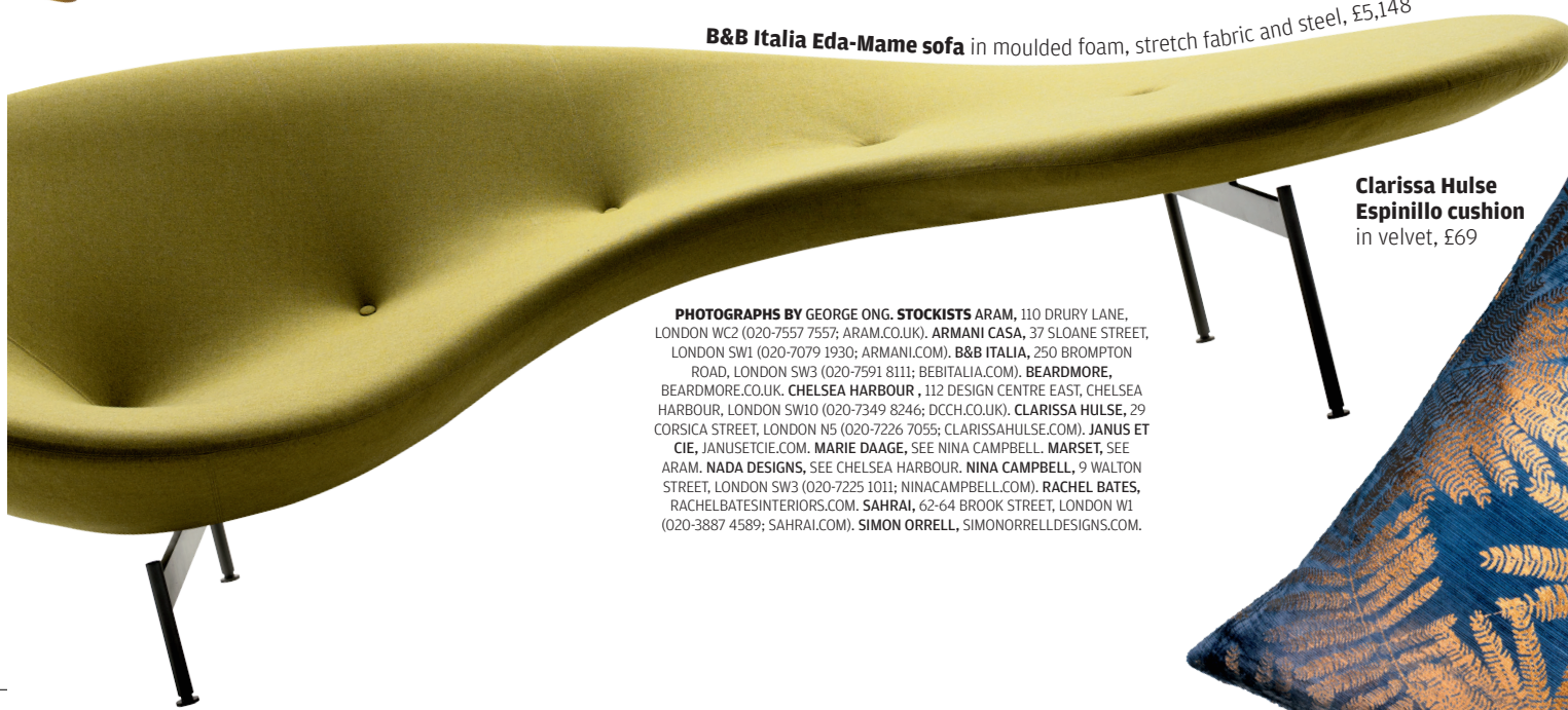
Clarissa Hulse Espinillo cushion in velvet, £69