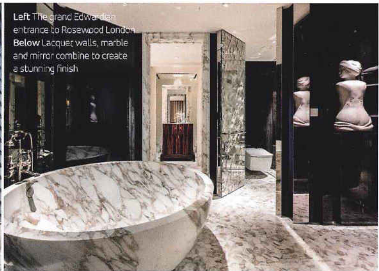
Left The grand Edwardian entrance to Rosewood London Below Lacquer walls, marble and mirror combine to create a stunning finish