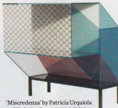
'Miscredenza' by Patricia Urquiola and Federico Pepe, £9,506, Editions Milano (editionsmilano.com)