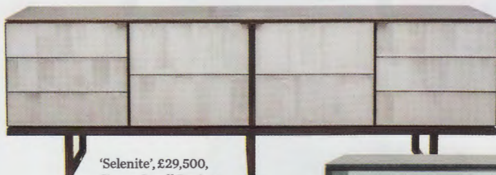
'Selenite', £29,500, Simon Orrell Designs (simonorrelldesigns.com)

No longer is this most useful of storage pieces designed to blend into the room. Architectural shapes and unusual materials are now key