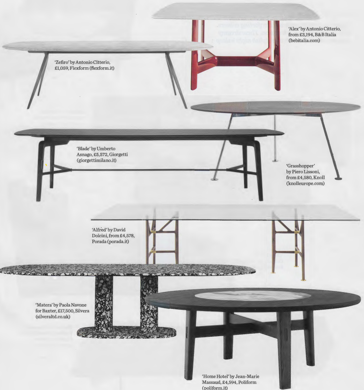
'Zefiro' by Antonio Citterio, £1,059, Flexform ( flexform.it )

It's where family and friends gather, celebrate and feast, so your table should be the centrepiece of the home. Be sure yours will make an impression with these hot new designs