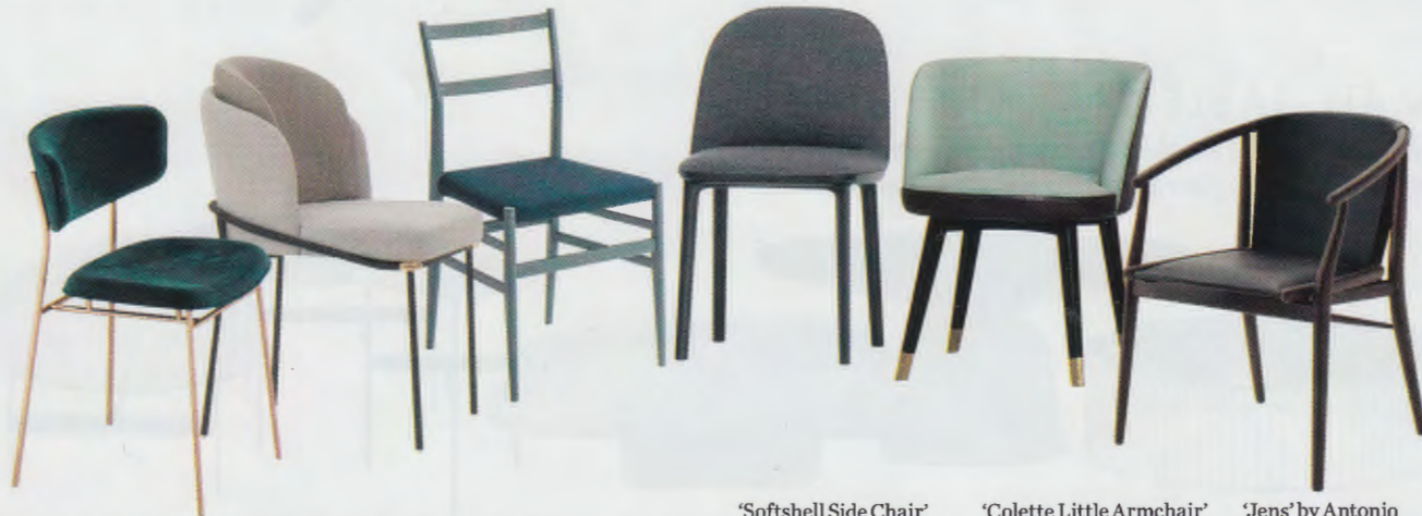
'Fifties' in 'Forest Green' velvet, £269, Calligaris (calligaris.com)

Entertain in style with seats designed to impress. With plush materials and cossetting shapes, they'll ensure your guests never want to leave the table