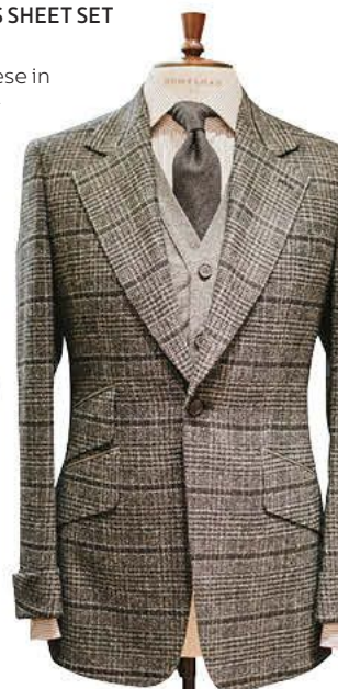
4. A one-button suit from Huntsman.