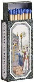
5. Buly 1803 Scented Matches.