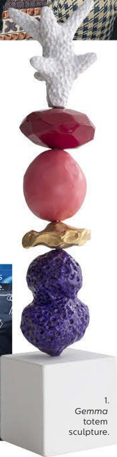
1. Gemma totem sculpture.