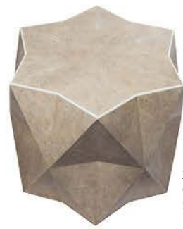
3. Simon Orrell Side Table.