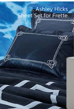
11. Ashley Hicks Sheet Set for Frette.