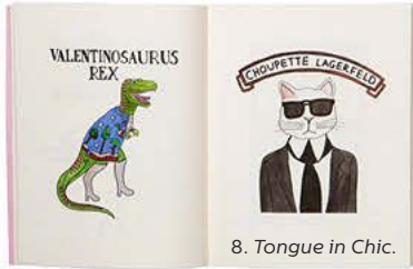
8. Tongue in Chic.