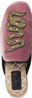
7. Gucci Velvet Evening Slippers with Snakes.