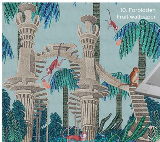
10. Forbidden Fruit wallpaper.