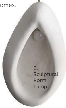
6. Sculptural Form Lamp.