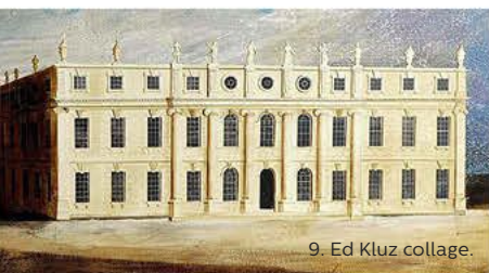
9. Ed Kluz collage.